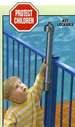
SIDE PULL model

MAGNA•LATCH is also suitable for house and garden gates where pet security and pet access control are important. It prevents pets from escaping and keeps them safe from unwanted intruders.