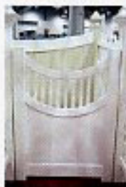
Scallop: 16-inch drop