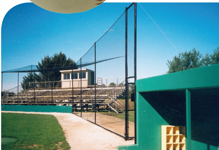
baseball netting custom fabricated to any size

Midwest Cover, Inc. is a manufacturer of baseball field screening, stadium safety netting and materials designed to keep players and spectators safe as well as enhancing the look of your facility. We have a full line of products to outfit an entire facility.